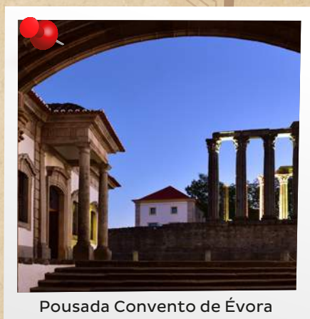
Pousada Convento de Évora