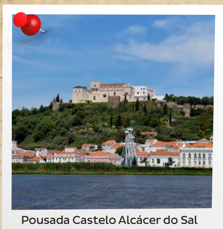
Pousada Castelo Alcácer do Sal