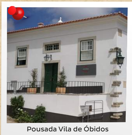
Pousada Vila de Óbidos