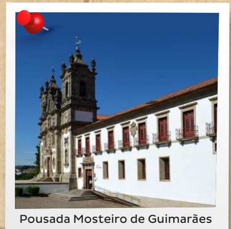
Pousada Mosteiro de Guimarães