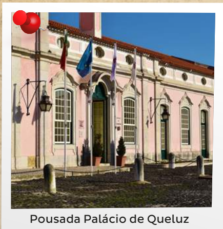
Pousada Palácio de Queluz