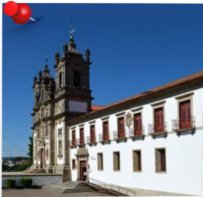
Pousada Mosteiro de Guimarães