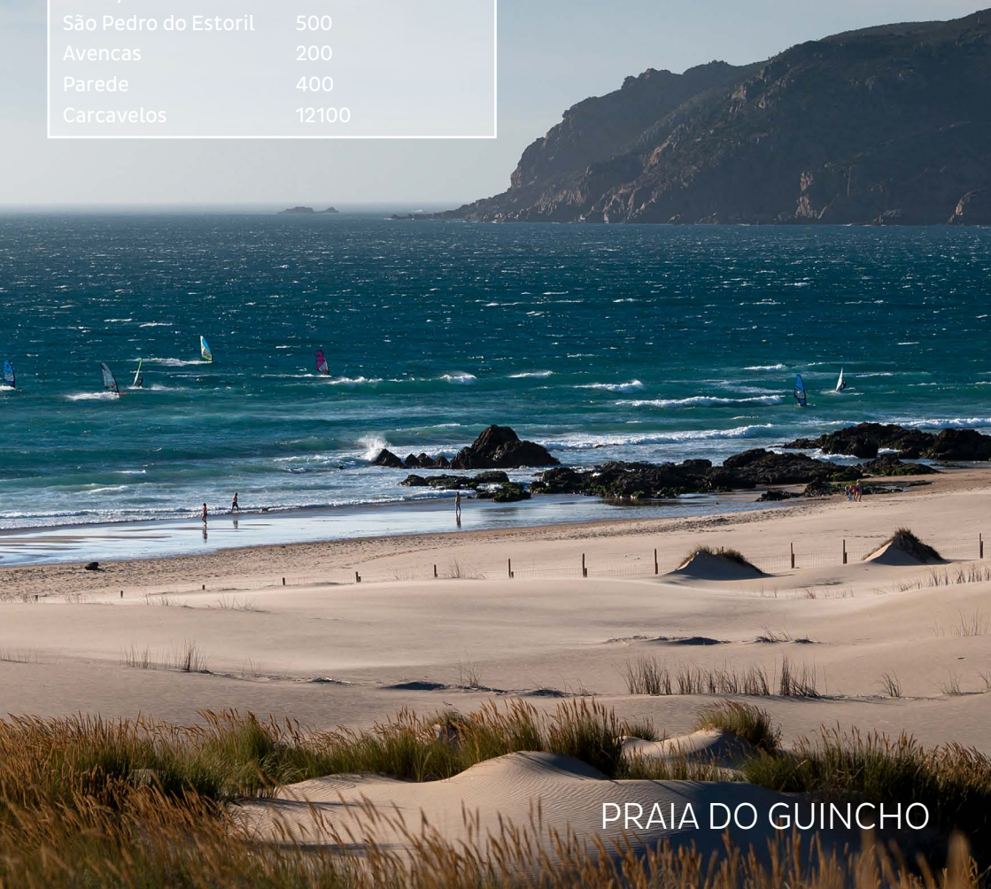
PRAIA DO GUINCHO