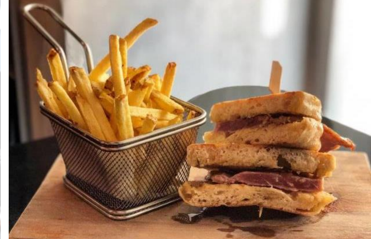
2. Sirloin steak sandwich in Bolo do Caco bread roll