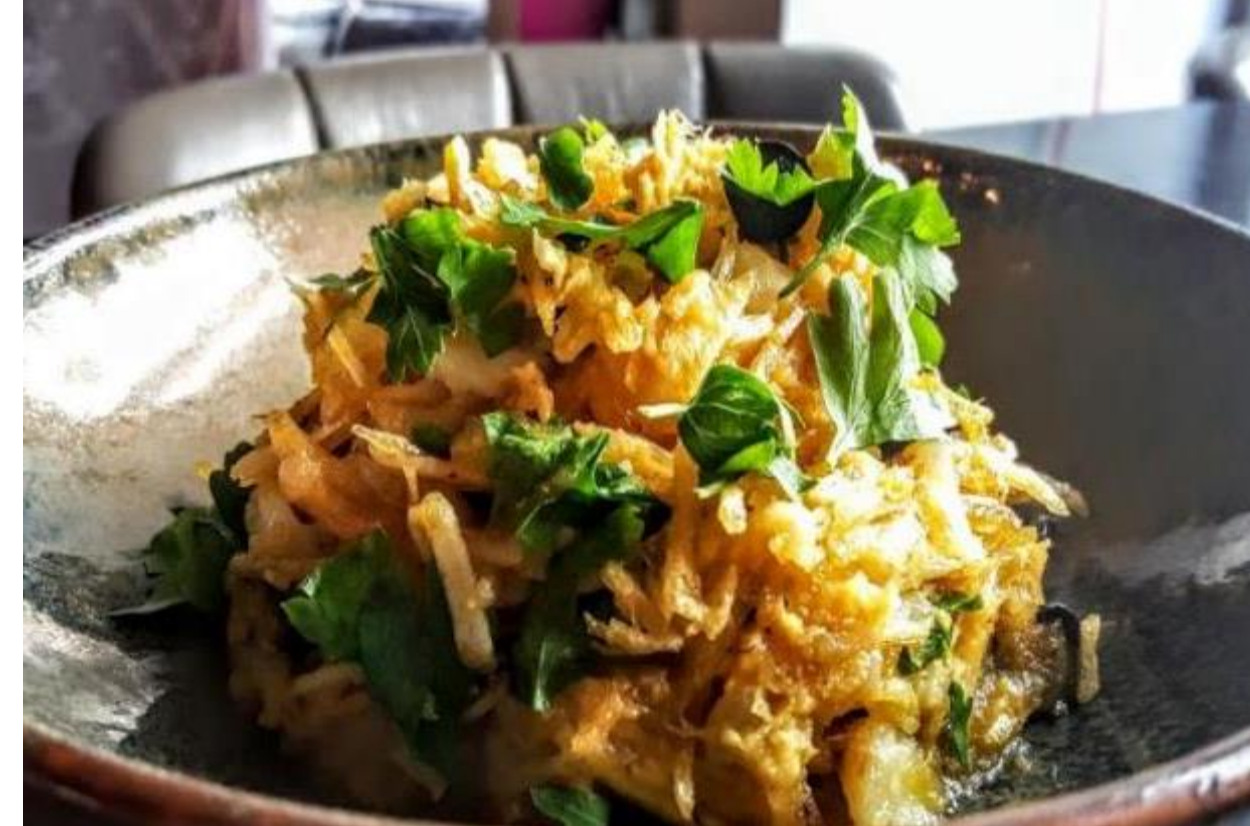
1. Cod à Brás