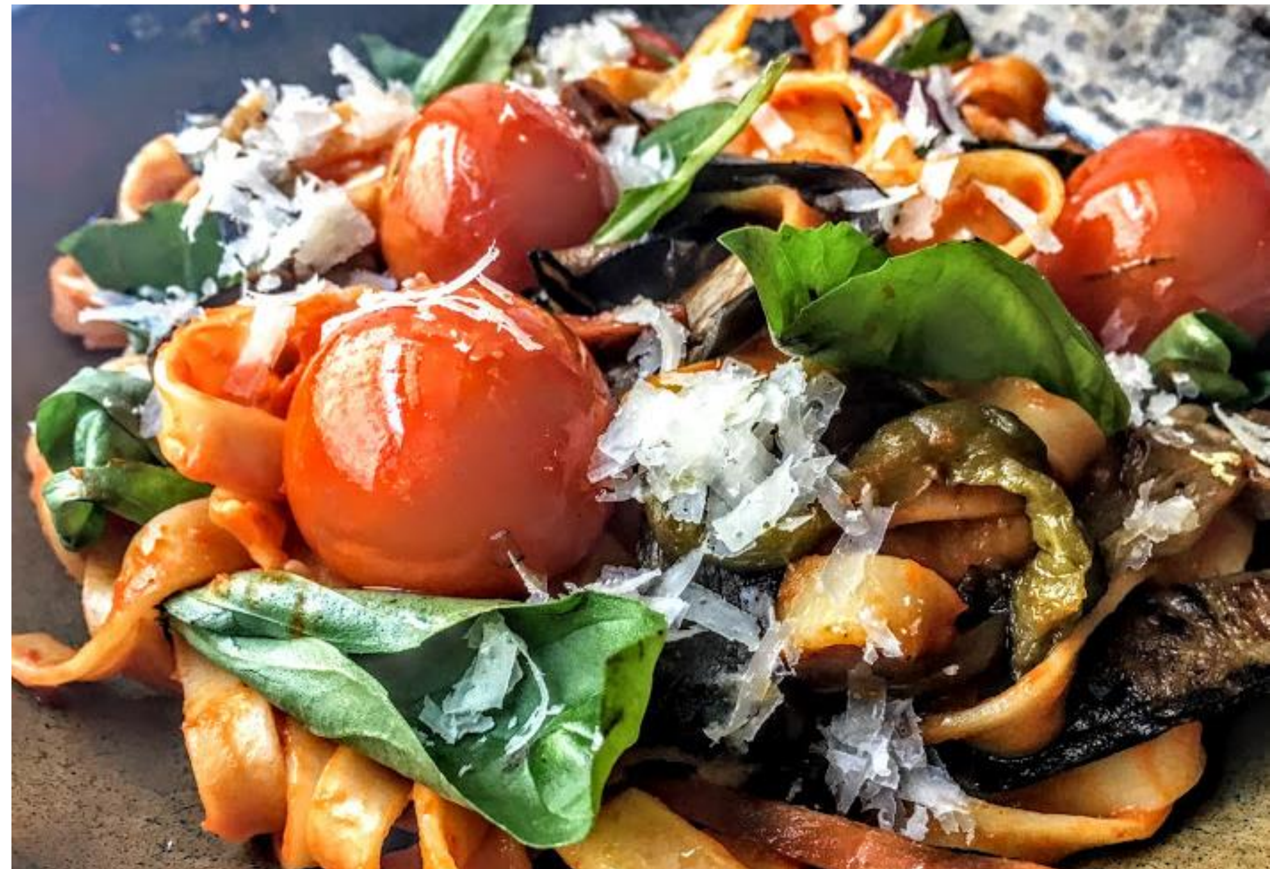
3. Grilled vegetable tagliatelle with basil and parmesan cheese